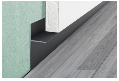
VARNISHED MATT BLACK ALUMINIUM thermo packed 2 Im20 Pcs - 40 lm